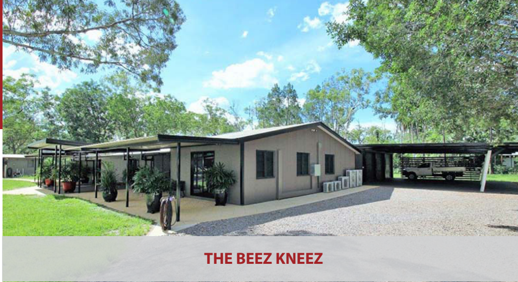
THE BEEZ KNEEZ